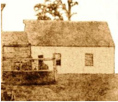
First Church at Letterewe about 1885