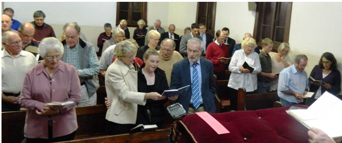
Synod Missions evening inside Wauchope Church, May 2014