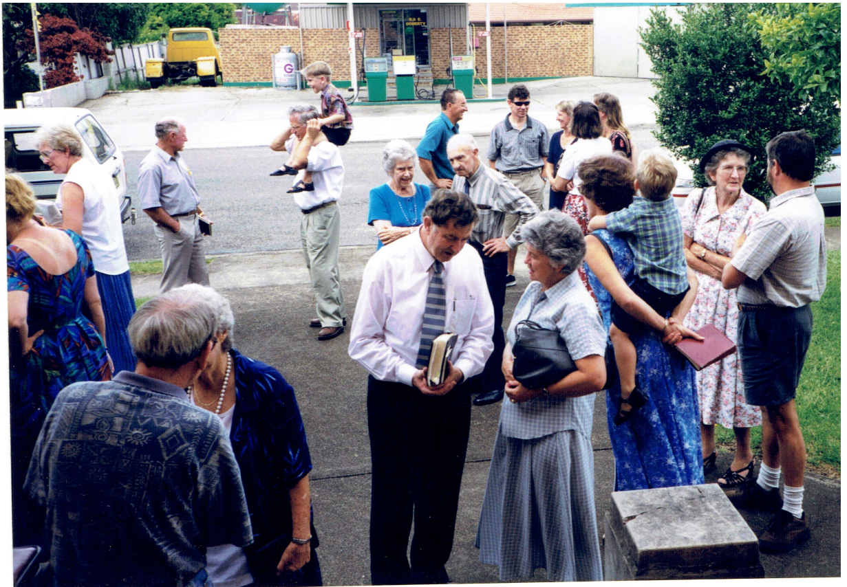
Morning Service at Wauchope about 1995