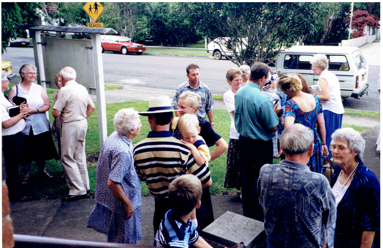
Morning Service at Wauchope about 1995, LHS