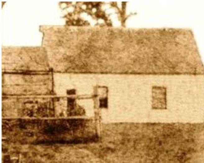
The first Church at Letterewe built 1871 beside the manse, courtesy Historical Society.