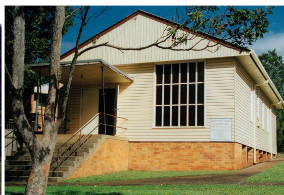
Port Macquarie Hall 1998