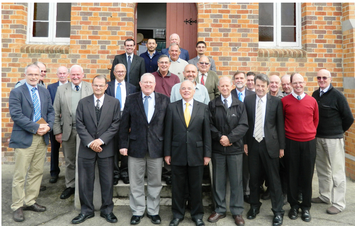
Synod Delegates [Ministers and Elders] at Wauchope Church May 2014, source Alex Steel.

There are other earlier Synod photos framed in the Hall, together with other enlarged framed photos and material on display. Original wide photo split into two parts as below.