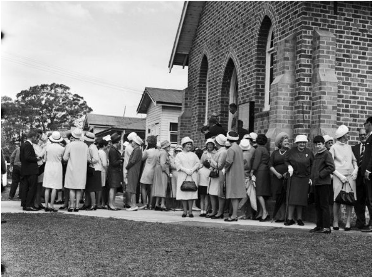
Free Presbyterian Church on Saturday 20 th September 1968