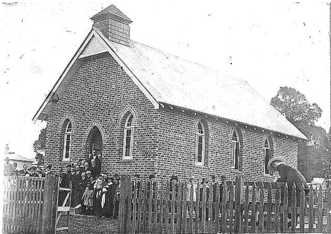
Opening of Free Church at 41 Campbell Street on 29 th August 1918.

The Port Macquarie News and Hastings River Advocate (NSW), 3rd August 1940.