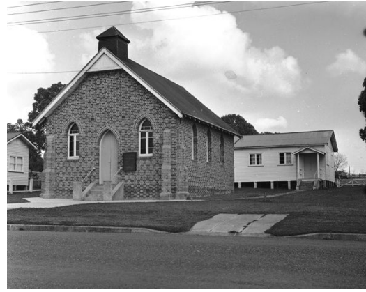
Present Church and Hall about 1968