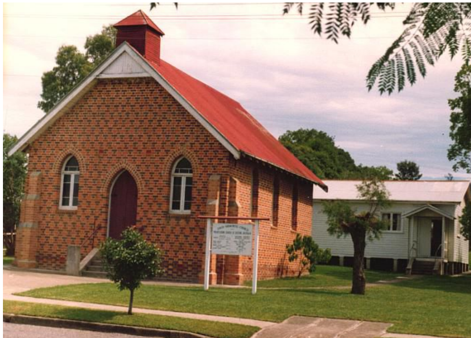
Image taken in 2010 showing the memorial notice board.

Held Saturday 1 st September 2018 at 1pm